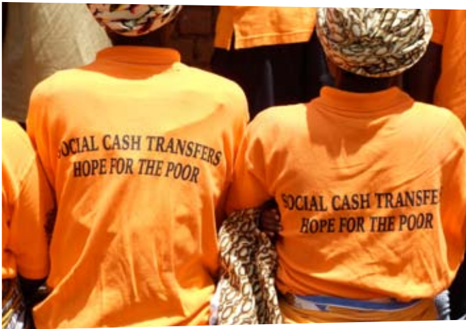
Members of a CWAC group